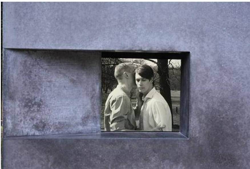
Figure 3: gay[sic] Memorial Berlin, detail 2009