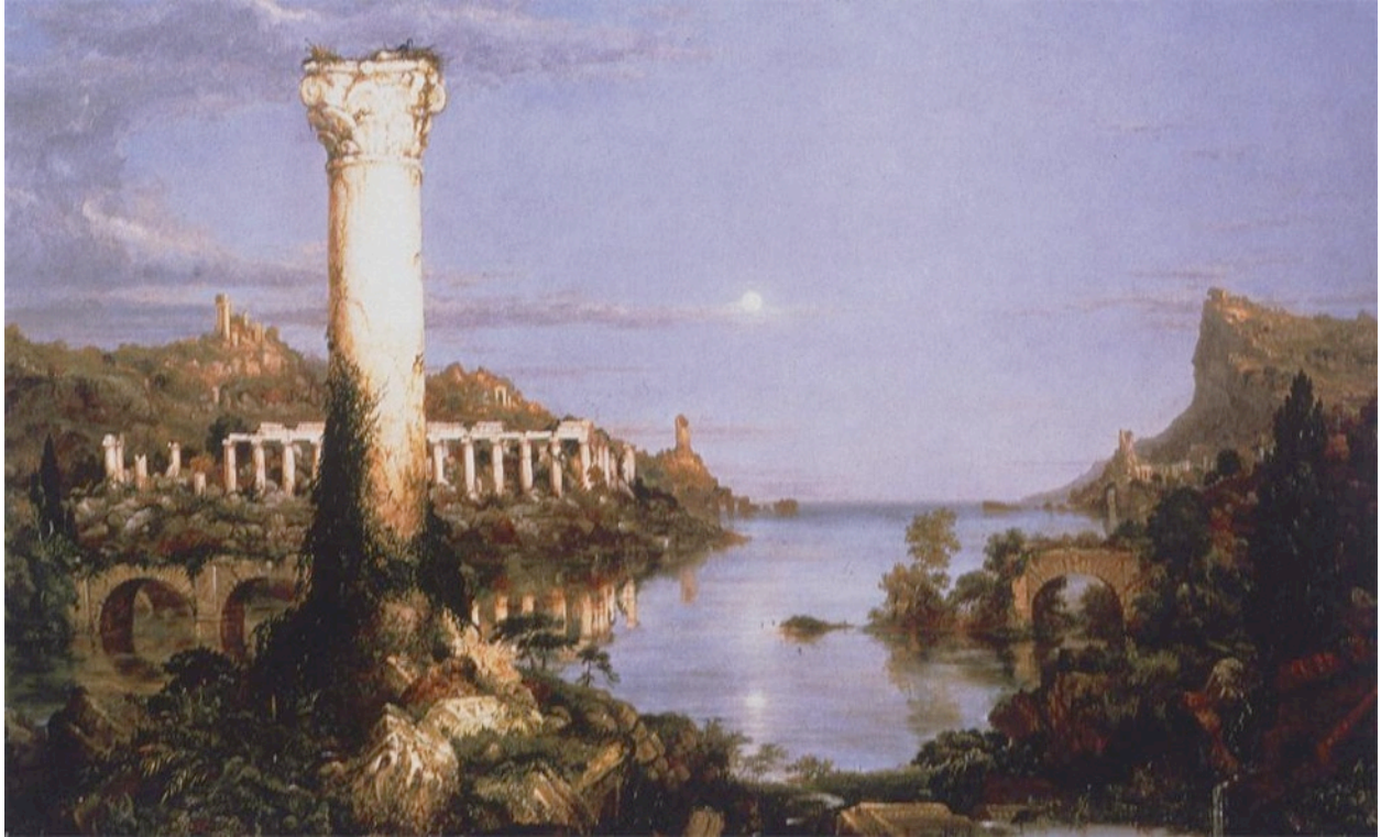
Figure 6. Thomas Cole, The Course of the Empire: Desolation , 1836, Oil on Canvas, 39 1/4 x 63 1/4 inches, The New York Historical Society, New York, NY.