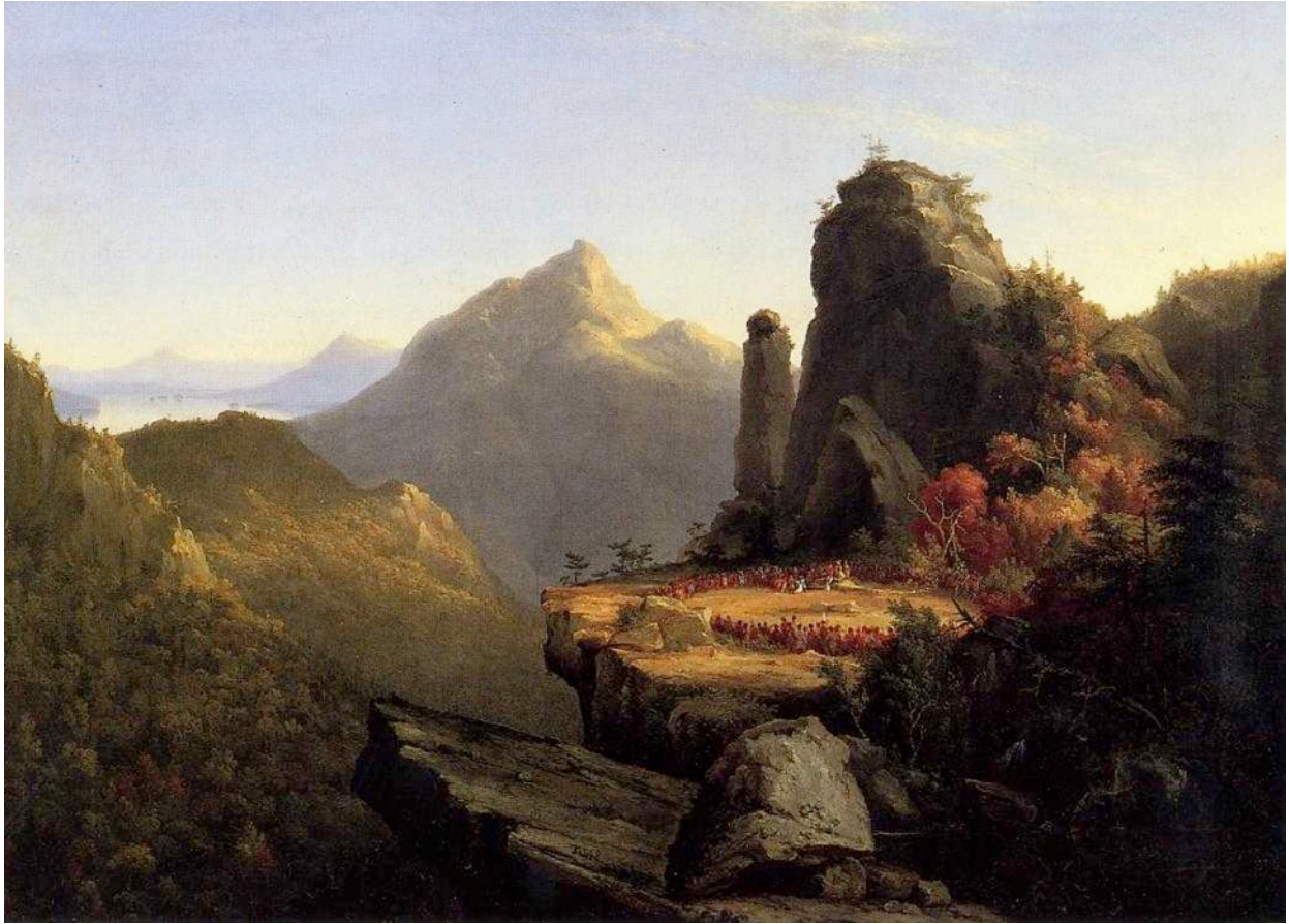
Figure 1. Thomas Cole, Scene from "The Last of the Mohicans:" Cora Kneeling at the Feet of Tamenund , 1827, Oil on Canvas, 25 3/8 x 35 1/16 inches, Wadsworth Atheneum, Hartford, Connecticut.