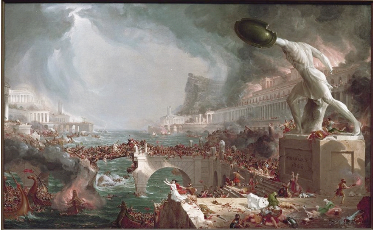
Figure 5. Thomas Cole, The Course of the Empire: Destruction , 1836, Oil on Canvas, 33 1/4 x 63 1/4 inches, The New York Historical Society, New York, NY.