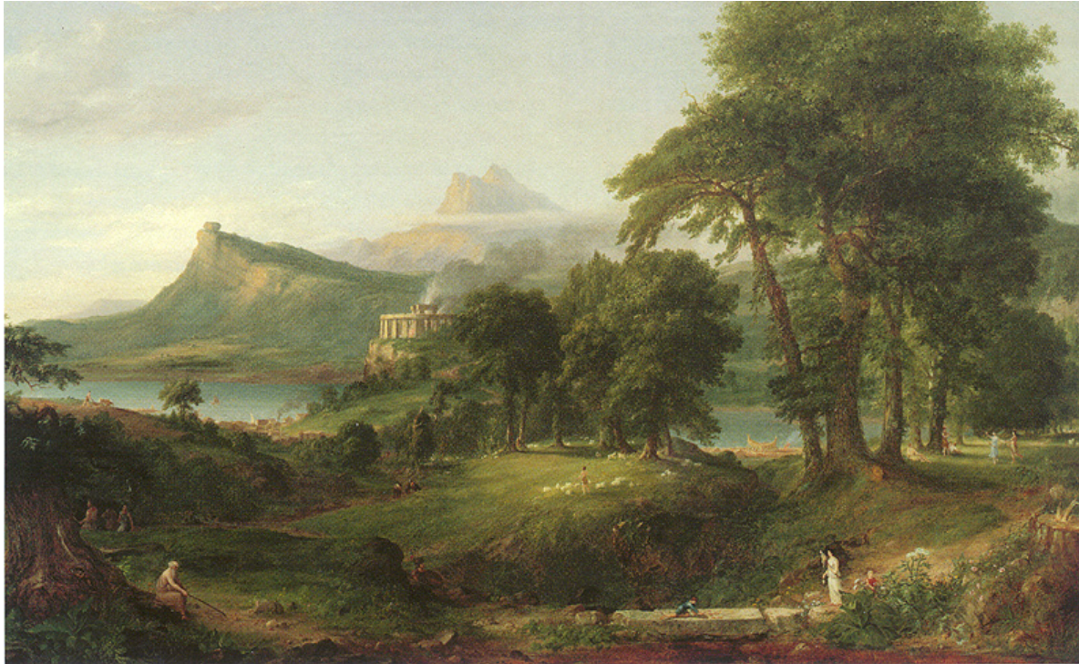
Figure 3. Thomas Cole, The Course of the Empire: The Pastoral or Arcadian State , 1834, Oil on Canvas, 39 1/4 x 63 1/4 inches, The New York Historical Society, New York, NY.