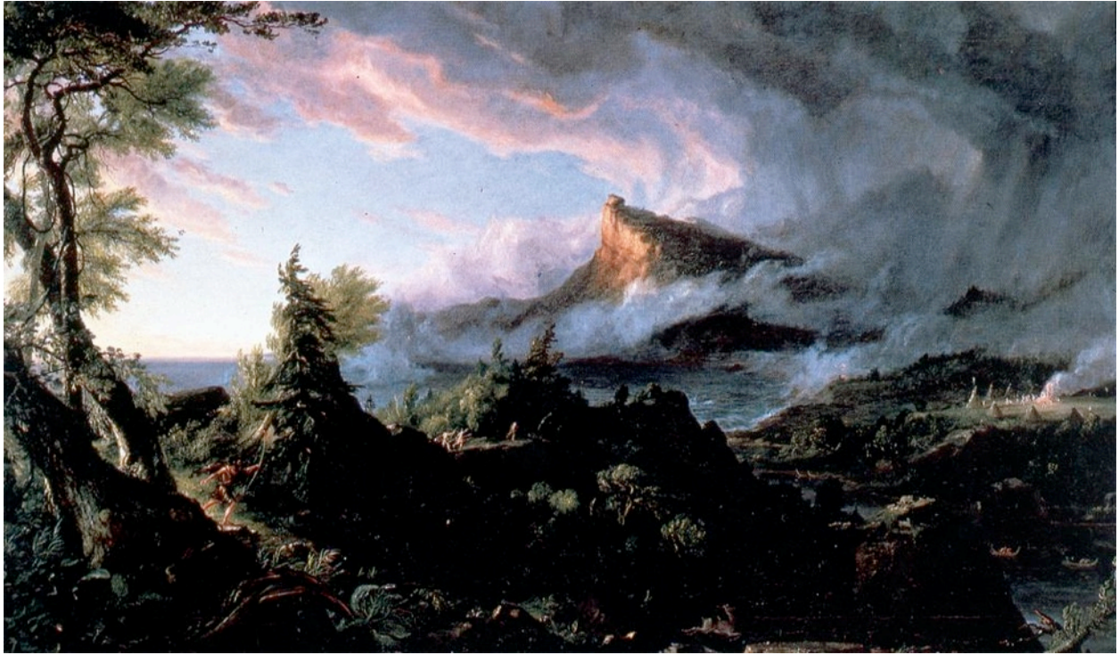
Figure 2. Thomas Cole, The Course of the Empire: The Savage State , 1834, Oil on Canvas, 39 1/4 x 63 1/4 inches, The New York Historical Society, New York, NY.