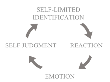
Fig.1: Limited Identification (1.4) – Reaction (2.3) – Emotion (1.31) – Self-Judgment (1.30)

The Transpositional Cycle includes beliefs and behaviors rooted in the perception of a limited identity, or more generally in a narrow collection of transient identities. For the artist-performer, that may include limiting identifications such as "actor," "musician," or "thespian," as well as "success," "winner," or "acclaimed." Reactions of attachment and aversion to labels and experiences arise as a means to protect the ego's limited view of persona. If the artist-performer experiences feelings of inadequacy as a reflection of the past, depression results. If this yields presumptions that future performances will be inadequate, anxiety arises. If the artist-performer clings to praise only to be met with criticism however mild, self-judgment arises. Self-judgment rooted either in the past or in projections of the future only strengthens the already imprinted grooves of limited identification, creating doubt, apathy, and even greed.<sup>8</sup> In such cases, conditioned habits control creativity, rather than permitting choices based on awareness of habitual patterning and discernment.